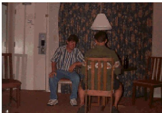
AAPT members (you know who you are!) Discuss the sessions during leisure time.